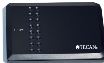
Figure 1: Tecan's NanoQuant Plate. The figure shows the NanoQuant Plate with closed lid as it will be read by the Infinite 200 readers, see also [2].